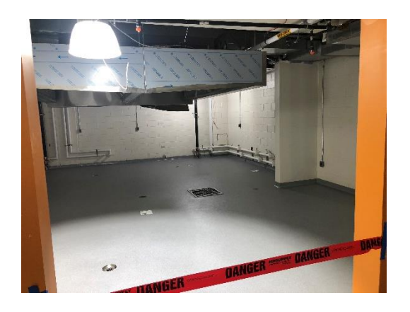
Epoxy Flooring at Cafeteria Kitchen