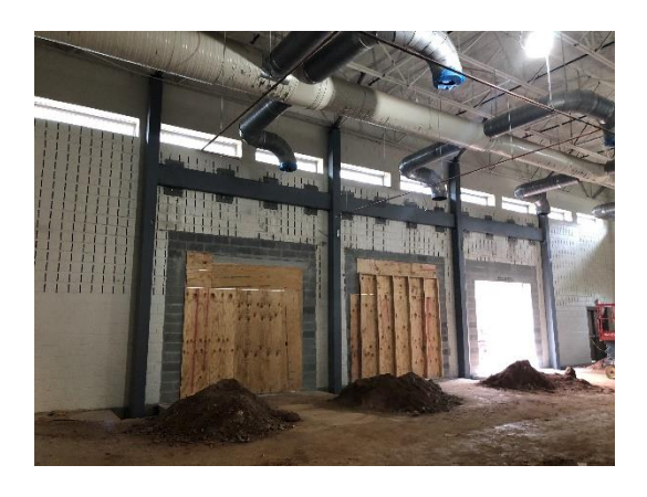
Structural Steel Installed at Auto Lab Openings