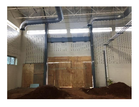
Structural Steel Installed at Aviation Openings