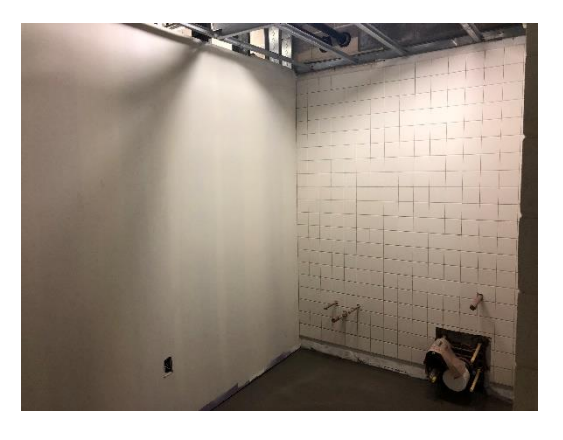
First Floor Restroom Wall Tile & Priming