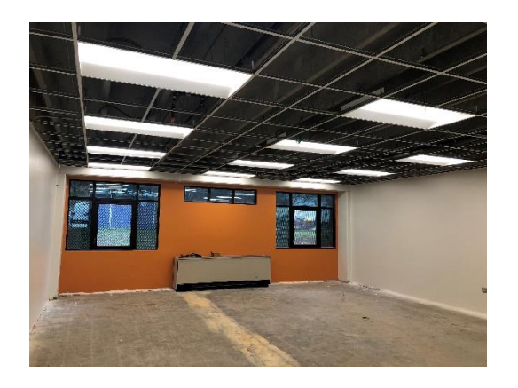
Second Floor Classroom New Light Fixtures